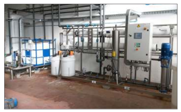
The new Nalco Water RO plant