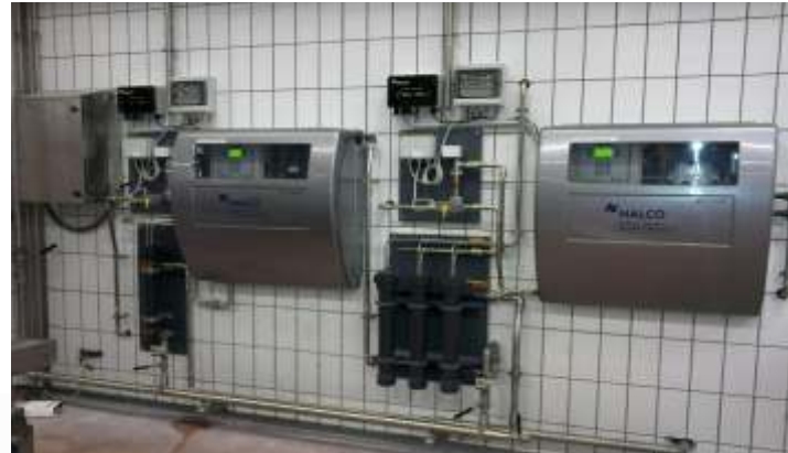
Nalco Water 3D TRASAR units in hot and cold legs of STORK hydrostatic sterilizer

Despite years of general economic crisis, the site production levels were growing. In addition the customer was increasing its commitment and effort to TCO reduction and water, energy and waste reduction.