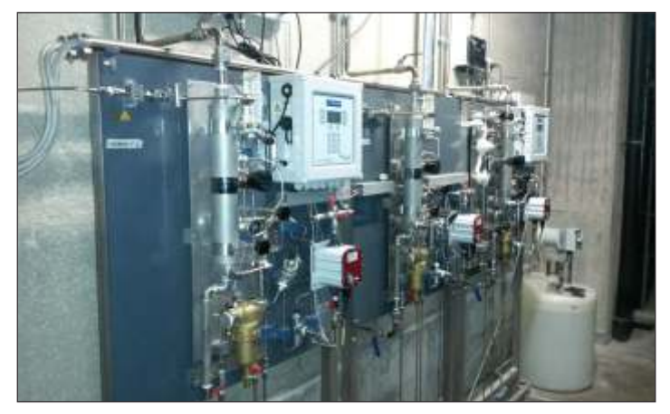
The new 3D TRASAR Boiler Technology units