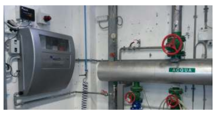
Nalco Water 3D TRASAR unit in the retorts cooling system