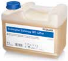
Aniosyme Synergy WD Ultra 5 L Canister

Di-enzymatic detergent for alkaline cleaning power