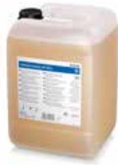
Aniosyme Synergy WD Ultra 20 L Canister